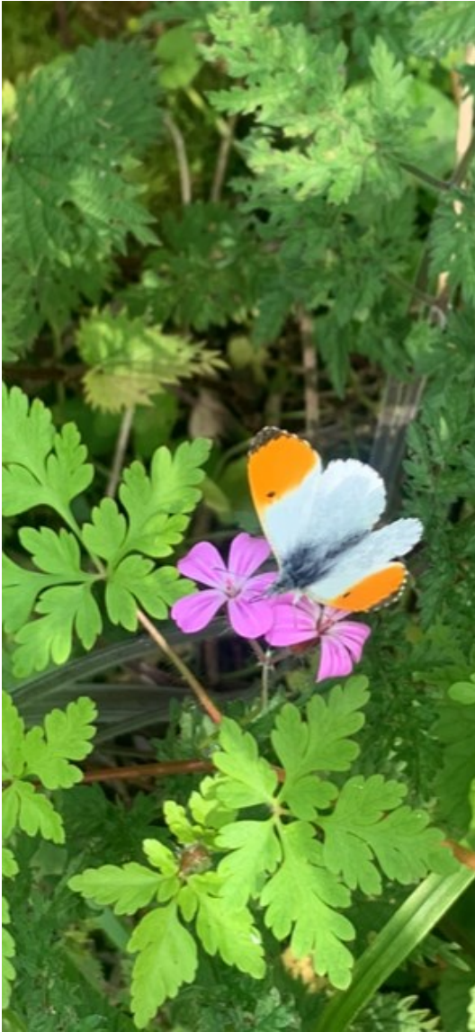
Orange Tipped Butterfly - male