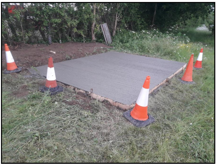
13<sup>th</sup> June 2022. Plinth formwork built and fixed to sub base slab.