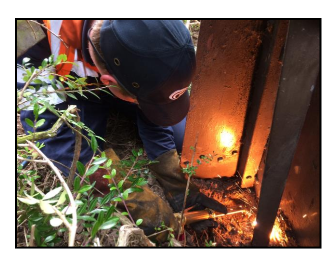
1<sup>st</sup> July 2020. Our third visit to Clifton. Mammoth cut free and on the move.