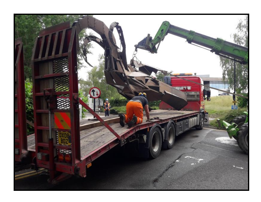
Ready to leave Clifton.