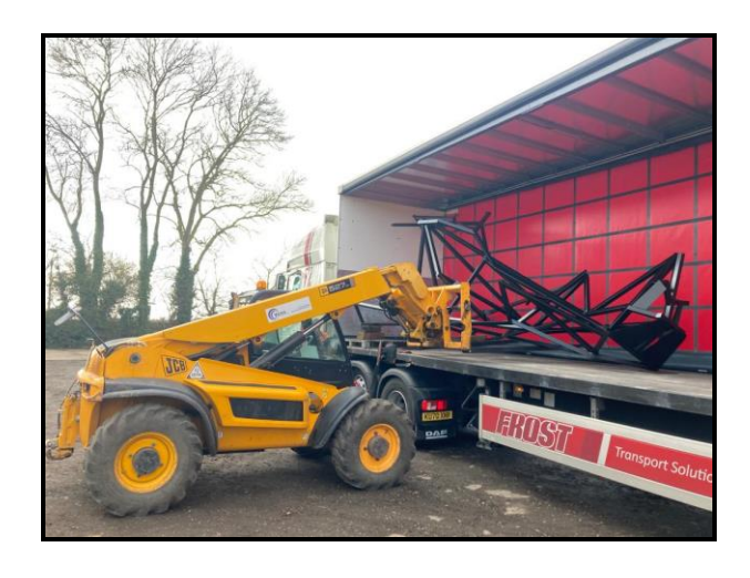
21<sup>st</sup> March 2022. Mammoth pieces returned shot blasted and painted.

Planning permission was applied for and subsequently granted on the 6<sup>th</sup> April 2022.