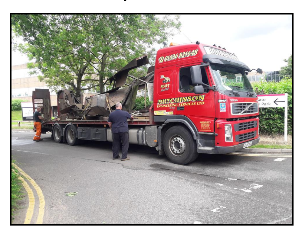
Arriving at Thurgarton.