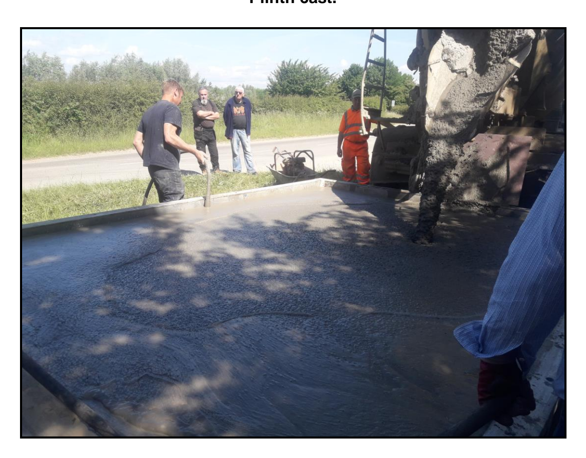
The groundworks team.